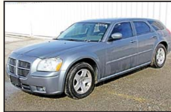
2006 DODGE MAGNUM SXT