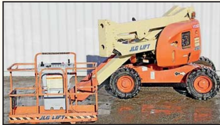
JLG 450A ARTICULATING BOOM LIFT