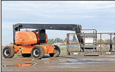
2003 JLG 800A 4X4 BOOM LIFT