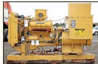
CATERPILLAR 3208 SKID-MOUNTED GENSET