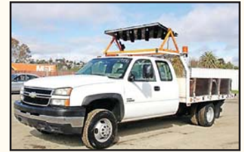
(1 OF 10) ASSORTED FLATBED TRUCKS