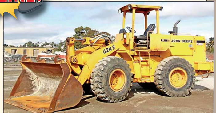
JOHN DEERE 624E RUBBER TIRE LOADER

DAY 2: SATURDAY, FEBRUARY 20 AT 10:00 A.M.