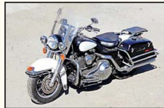
HARLEY DAVIDSON AND BMW POLICE MOTORCYCLES