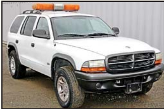
(1 OF 15) ASSORTED SUVs

SUVs: (4) 2008–2004 FORD Expedition XLT 4x4s; 2008 FORD Escape Hybrid; (6) 2001–1993 CHEROKEE Sports; (4) 2004–2002 JEEP Liberty 4X4 Sports; SUBARU Legacy Station Wagon; 2002 FORD Taurus SE Station Wagon; (6) 2006–1998 FORD Explorers; (3) 2001 CHEVROLET Blazers; 2000 GMC Jimmy.