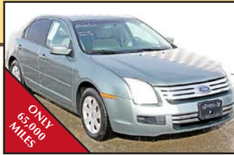
2006 FORD FUSION