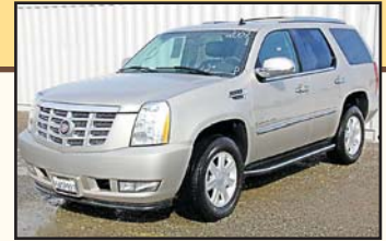
2007 CADILLAC ESCALADE – ASSET SEIZURE