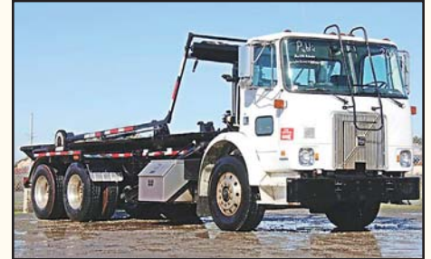
2000 VOLVO 3-AXLE ROLL BACK REFUSE TRUCK