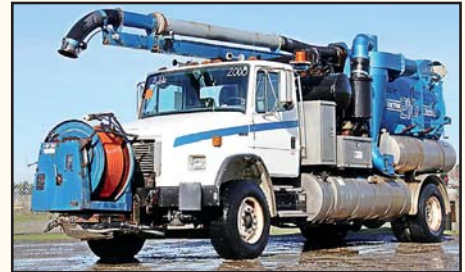
2000 FREIGHTLINER FL80 VAC-CON TRUCK