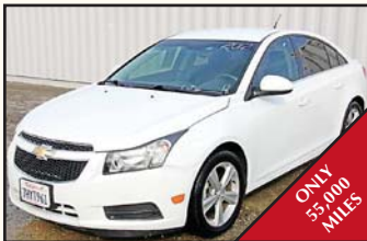
2012 CHEVROLET CRUZE LT – ASSET SEIZURE

★ RING 1: Asset Seizures, Real Estate, (350+) Gov't Fleet Vehicles, Light Trucks, Boats, Motorcycles, Buses & More! ★