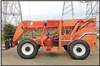
SKYTRAK 8042 4X4 TELEHANDLER