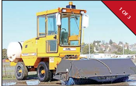
2010 LEEBOY 4870 CHALLENGER RIDE-ON SWEEPER, ONLY 615 HOURS