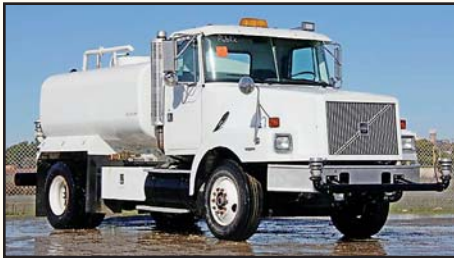
VOLVO 1,800-GALLON WATER TRUCK