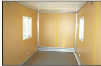
(1 OF 3) 8X20 PORTABLE OFFICES