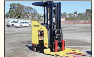
2014 HYSTER G118 ELECTRIC FORKLIFT, NEW AND UNUSED