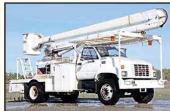
2000 GMC C7500 BUCKET TRUCK