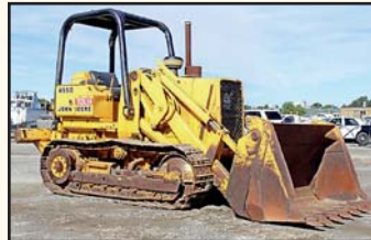
JOHN DEERE 455D CRAWLER LOADER