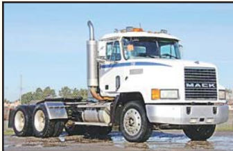
MACK CH600 3-AXLE TRUCK TRACTOR