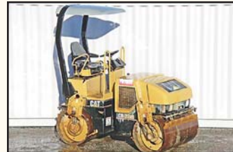
CATERPILLAR CB-224D TANDEM ROLLER