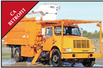
1991 INTERNATIONAL 4900 BUCKET TRUCK WITH DUMP BED