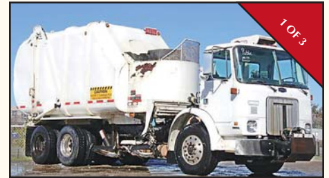
2003 AUTOCAR XPEDITOR SIDE LOADING REFUSE TRUCK