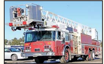
(1 OF 2) LADDER TRUCKS

HONDA Mowers, Power Trim Edgers, JOHN DEERE GS30 Walk-Behind Mower, TORO Walk-Behind Mowers.