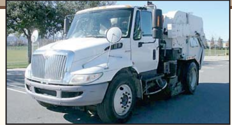
2008 INTERNATIONAL TYMCO SWEEPER TRUCK