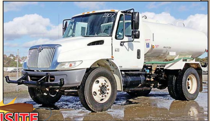
2007 INTERNATIONAL 4200 2,000-GALLON WATER TRUCK