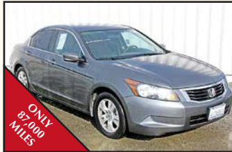
2010 HONDA ACCORD – ASSET SEIZURE