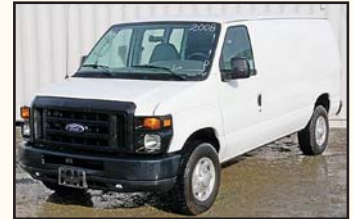
(OVER 15) ASSORTED VANS

Call for Additions or Deletions. Items That Are Still on Rent May Be Substituted!