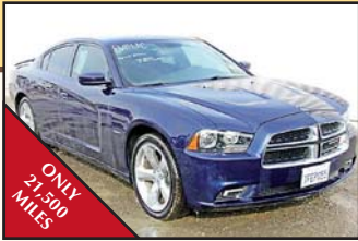
2013 DODGE CHARGER – ASSET SEIZURE