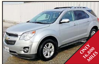
2013 CHEVROLET EQUINOX – ASSET SEIZURE