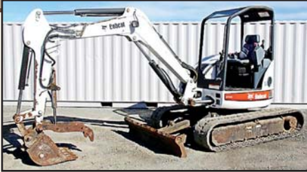
BOBCAT 435G MINI EXCAVATOR WITH THUMB