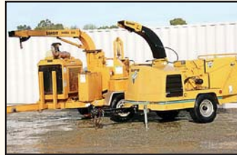
BANDIT AND VERMEER BRUSH CHIPPERS