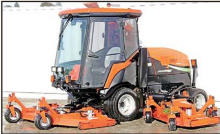
JACOBSEN HR-9016 4X4 RIDE-ON MOWER