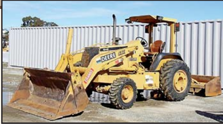
JOHN DEERE 210LE 4X4 SKIP LOADER