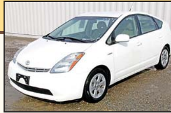
2007 TOYOTA PRIUS