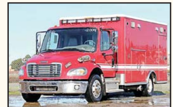
2004 FREIGHTLINER AMBULANCE