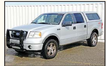
2007 FORD F-150 4X4 PICKUP TRUCKS