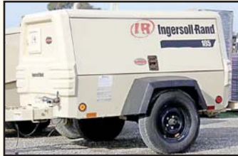
(1 OF 4) INGERSOLL RAND 185 AIR COMPRESSORS