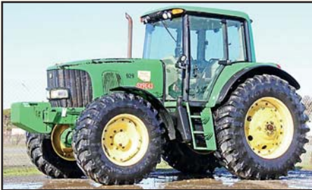
JOHN DEERE 7220 4X4 UTILITY TRACTOR