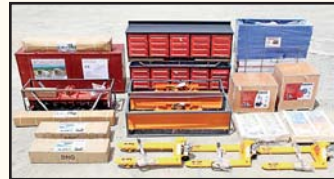
ASSORTED NEW AND UNUSED TOOL BOXES, TOOLS AND ATTACHMENTS